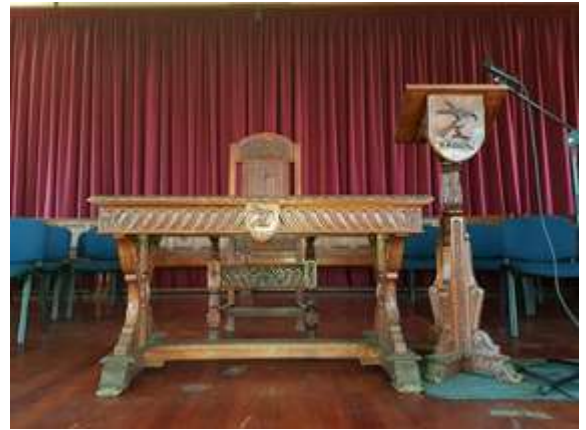
Where the Headmaster sits for Assembly

Recently we were contacted by the great granddaughter of the gentleman who carved the furniture that sits on our stage today. We were able to tell her that it is used at every assembly and prizegiving and is a prized piece of our history.