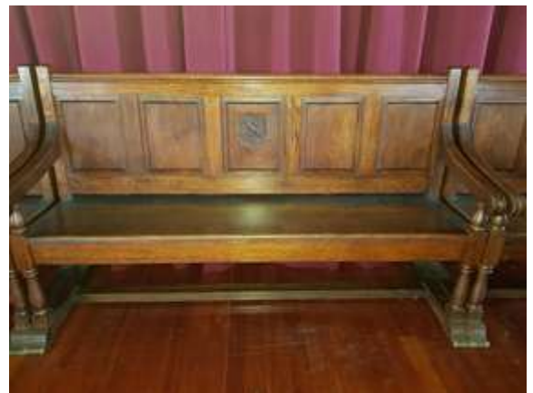
The benches on the back of the stage where teachers sit