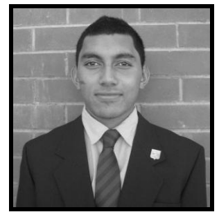
Uefa Pio Cultural Captain