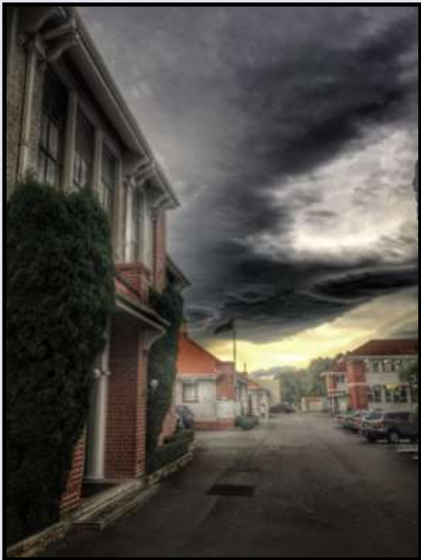
Stormy skies on an early April morning at HBHS