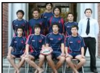
Junior A Touch Team