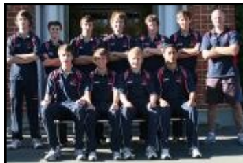
1st XI Cricket Team