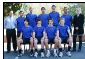
Senior A Volleyball Team