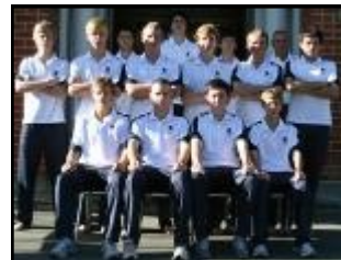
2nd XI Cricket Team