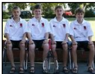
Junior A Tennis Team