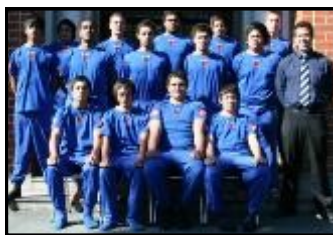
Senior Softball Team