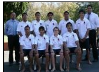
Senior B Volleyball Team