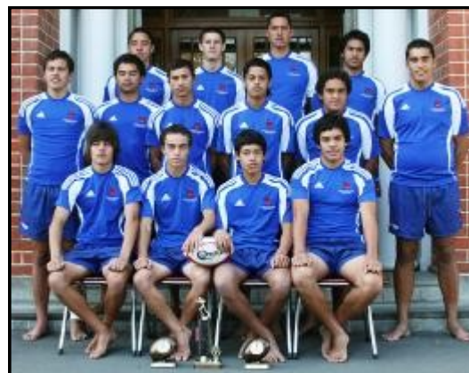
Senior Touch Team: Regional Champions 2011