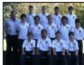
Colts Cricket Team